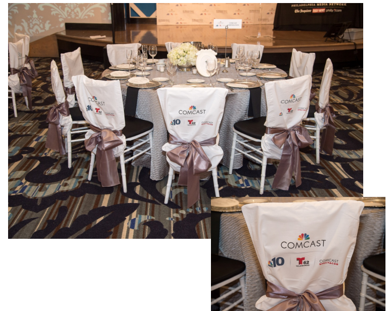
Branded Premium Seating