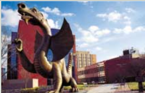
The Drexel Dragon at 33rd & Market streets stands guard over Drexel's campus (above) and Locust Walk, a pedestrian thoroughfare between 34th & 40th streets, bisects Penn's campus (below).