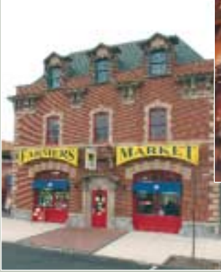
Firehouse Farmers Market (above) at 50th & Baltimore Ave.