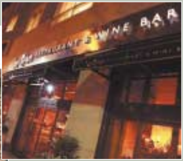
Penne Restaurant & Wine Bar at 3611 Walnut Street.