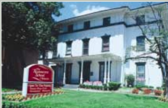
The Rest. School at Walnut Hill College lies in the heart of University City on 42nd & Walnut streets (above). Students relaxing on Univ. of the Sciences' campus next to Clark Park at 43rd & Woodland Avenue (below).