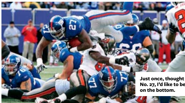
Just once, thought No. 27, I'd like to be on the bottom.

When it comes to the thunder-and-lightning running game, this 6'4", 264-pound back brings the noise.