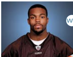
BRAYLON EDWARDS • CLEVELAND BROWNS

I have my own line of ice cream: Louisiana Pecan Crunch. It's got all my favorite flavors in there: pecan, chocolate, caramel. I've eaten quarts of it. But I'll be down to 255 at training camp.