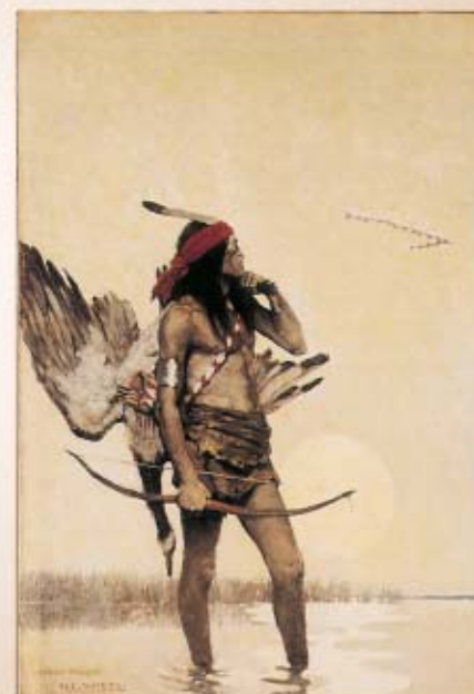
N. C. Wyeth, The Hunter , oil on canvas, 1906.

American illustration has deep roots in the Brandywine Valley, where Howard Pyle worked and taught such artists as N.C. Wyeth and Maxfield Parrish. These and other important