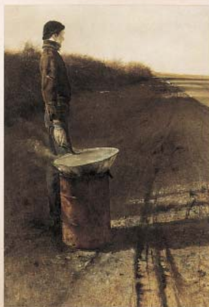
Andrew Wyeth, Roasted Chestnuts , tempera, 1956.

The Brandywine River Museum is home to one of the largest and most comprehensive collections of works by N.C., Andrew, and Jamie Wyeth, three generations of artists who embody the family's distinctive artistic legacy. Many familiar works, and many rarely on public view, are seen in regularly changing exhibitions.