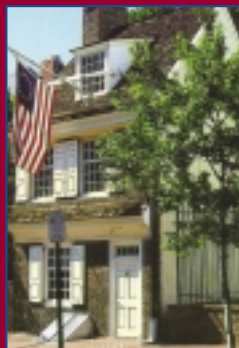
Betsy Ross House