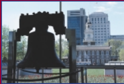
The Liberty Bell Pavilion