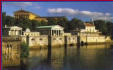
Art Museum & Philadelphia Water Works