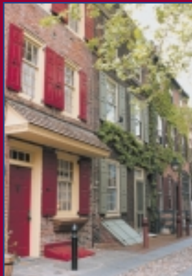
Elfreth's Alley-Philadelphia's Oldest Residential Street