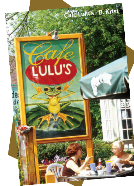
Cafe Lulu's - B. Krist