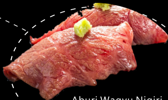
Aburi Wagyu Nigiri 炙烧和牛寿司 $14