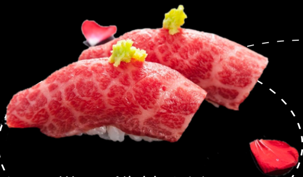
Wagyu Nigiri 和牛寿司 $12