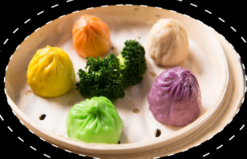
Rainbow Soup Dumplings (Wagyu Beef) 五彩小笼包 (和牛) $14.99