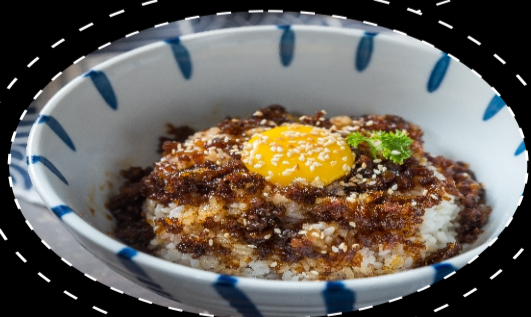
Wagyu Ya Style Bibimbap 鸡蛋和牛拌饭 $15