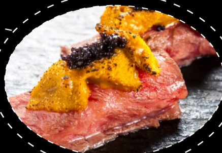
Aburi Wagyu Uni Nigiri 炙烧和牛海胆寿司 $18 ★