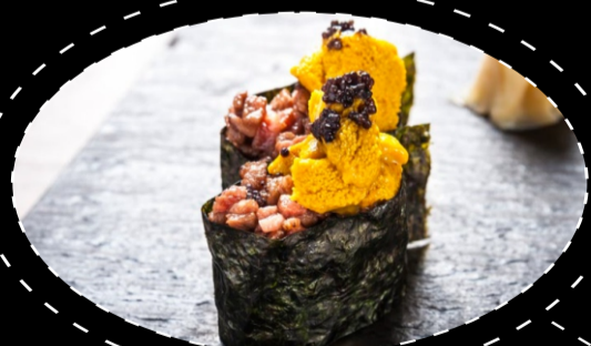
Maki Roll Uni Wagyu Gunkan Maki 炙烧和牛海胆卷 $24