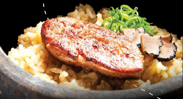
Foie Gras Isiyaki Kobe Bibimbap 黑松露鹅肝神户牛拌饭 ★ (Must try) $28