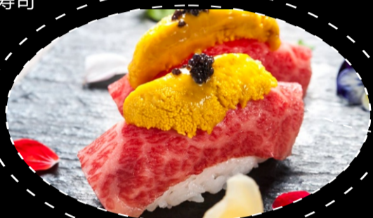
Wagyu Uni Nigiri 和牛海胆寿司 $18