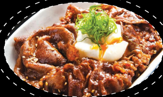
Wagyu Shabu Shabu Don 和牛盖烧丼 $22