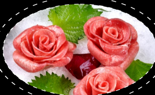
Slow Cooked Wagyu Beef Tongue ( Hot pot/Charcoal Grill ) 低温慢煮牛舌 (火锅/烧烤) $19.99