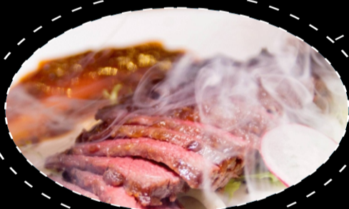
Slow Cooked Wagyu ( Hot pot/Charcoal Grill ) 低温慢煮和牛 (火锅/烧烤) $19.99