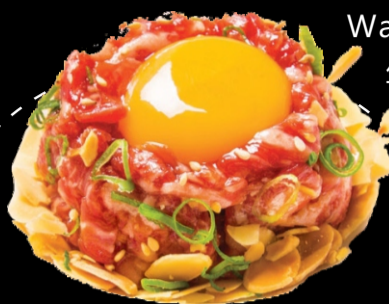
Wagyu Yukke 生拌和牛 $14