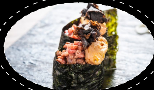
Foie Gras Wagyu Gunkan Maki 炙烧和牛鹅肝卷 $24