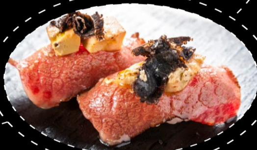
Aburi Wagyu Foie Gras Nigiri 炙烧和牛鹅肝寿司 $18