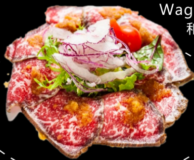
Wagyu Tataki 和牛沙拉 $17