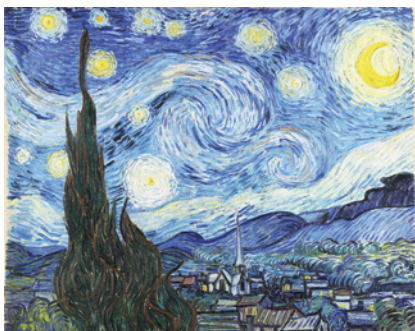
The Starry Night by Vincent van Gogh