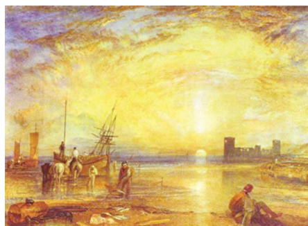
Flint Castle by William Turner