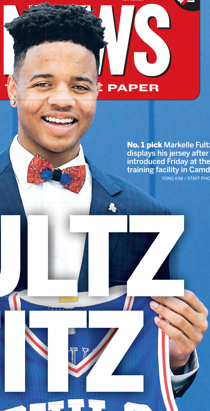
No. 1 pick Markelle Fultz displays his jersey after he was introduced Friday at the Sixers training facility in Camden.