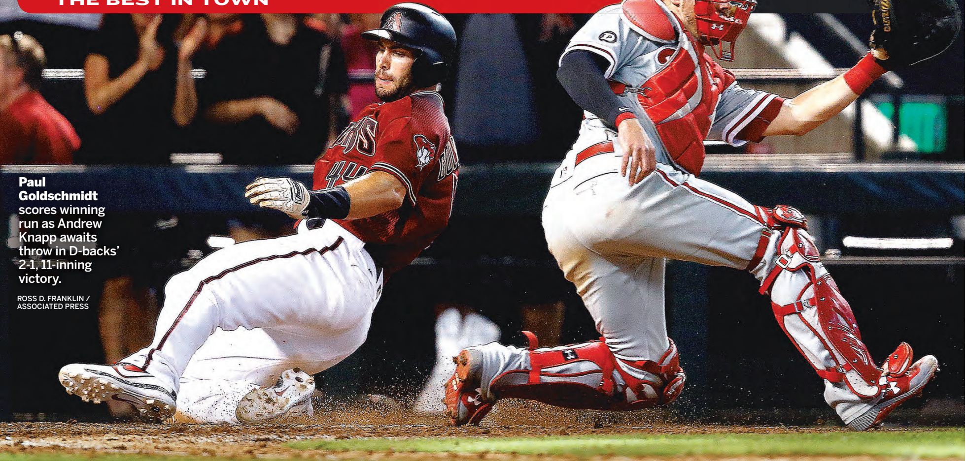
Paul Goldschmidt scores winning run as Andrew Knapp awaits throw in D-backs' 2-1, 11-inning victory.