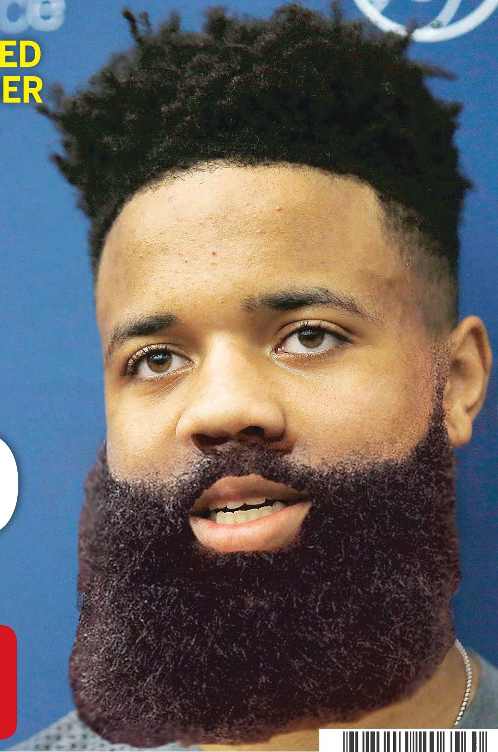
Markelle Fultz, pictured with James Harden's beard, doesn't really have a beard – or Harden's defensive indifference.